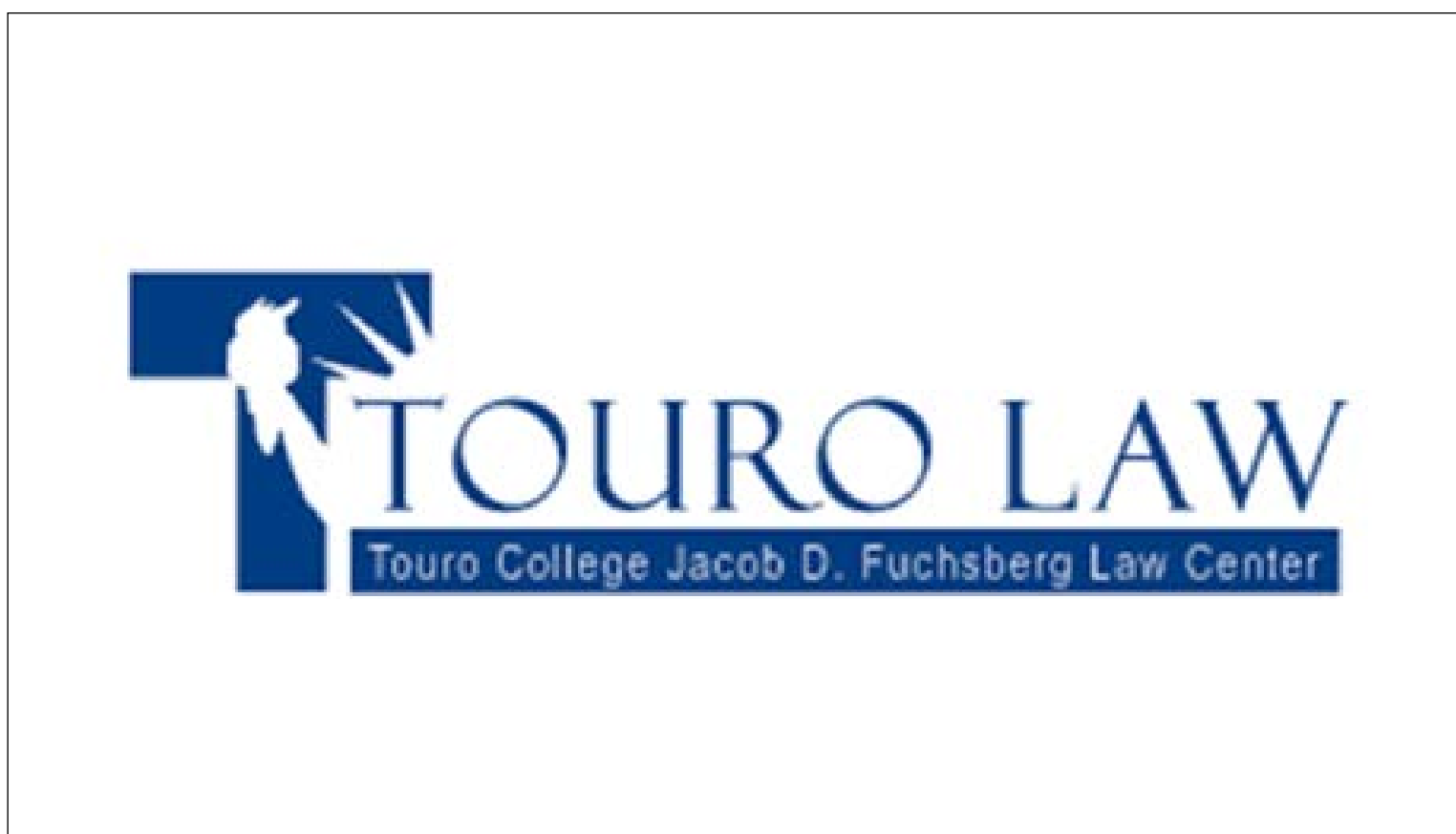
Touro Law School | Disaster Relief Clinic Law School Group