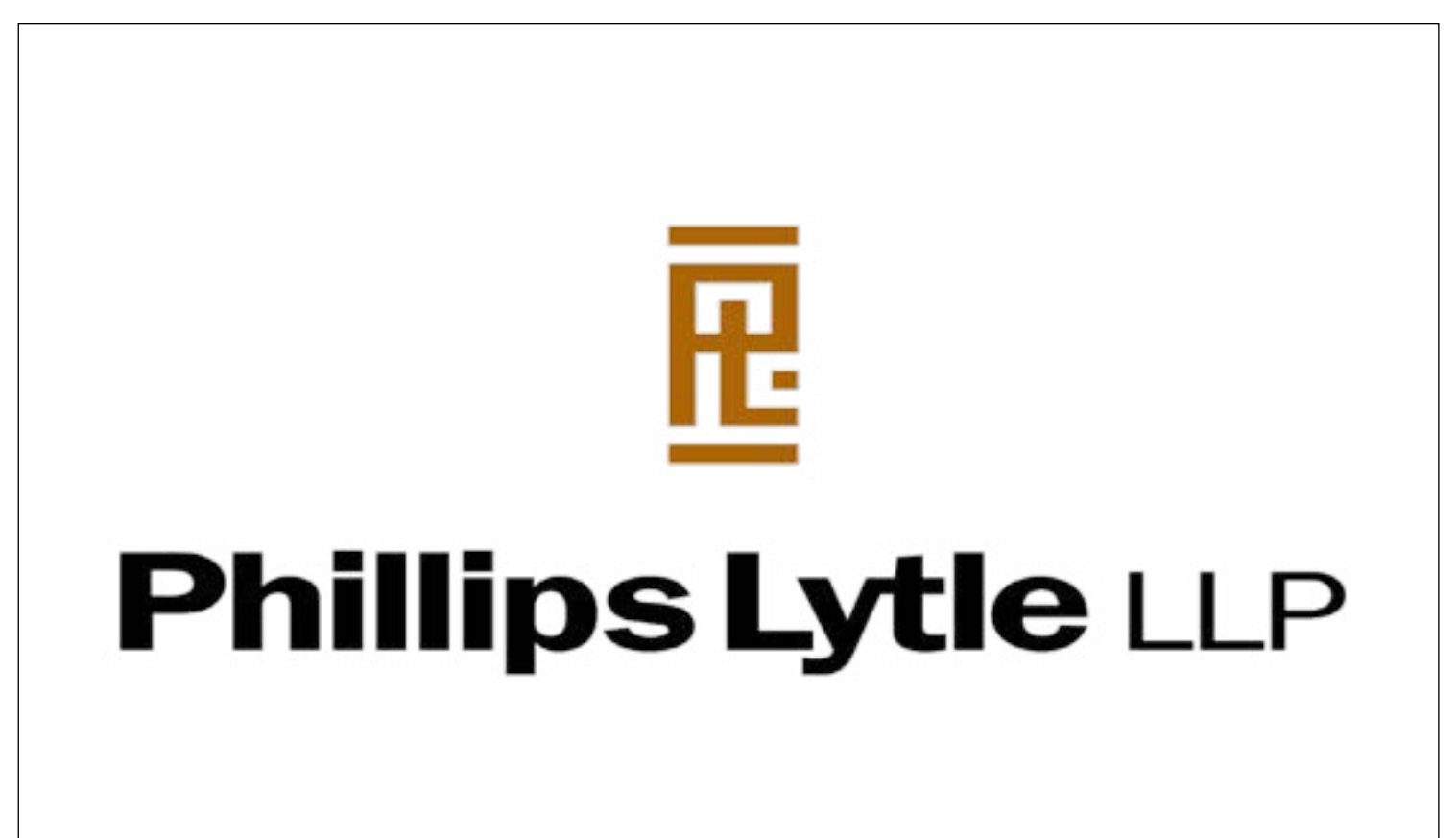
Phillips Lytle Small/Medium Law Firm