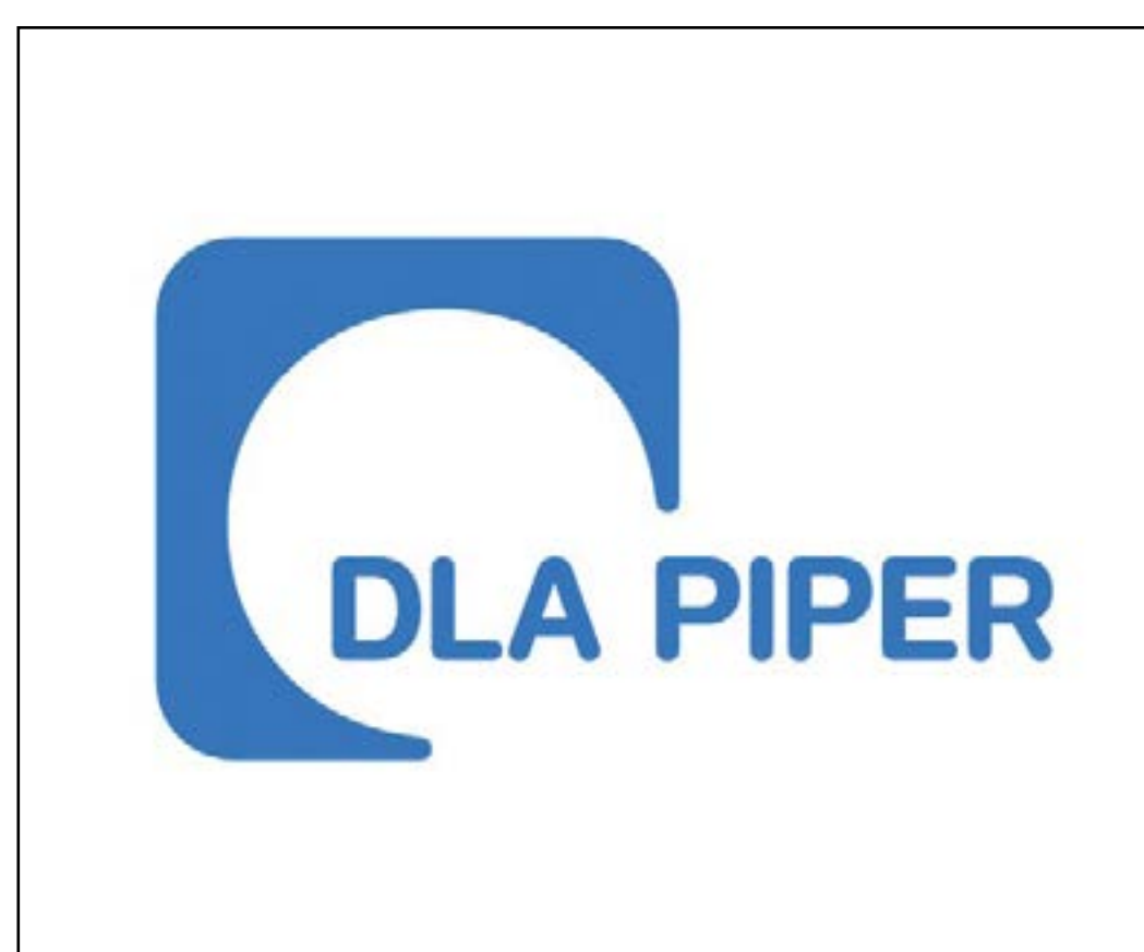
Large Law Firm DLA Piper LLP (US)