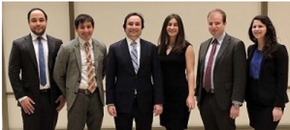
Large Law Firm Kramer Levin Naftalis & Frankel LLP New York, NY

Atlanta. After retiring in 2016, she returned to Rochester and joined the New York Courts Attorney Emeritus Program, taking on cases regarding unemployment insurance hearings, name changes, debt collection, standby guardianships and wills via the Volunteer Legal Services Project. She also volunteer for its Federal Pro Se Assistance Program.