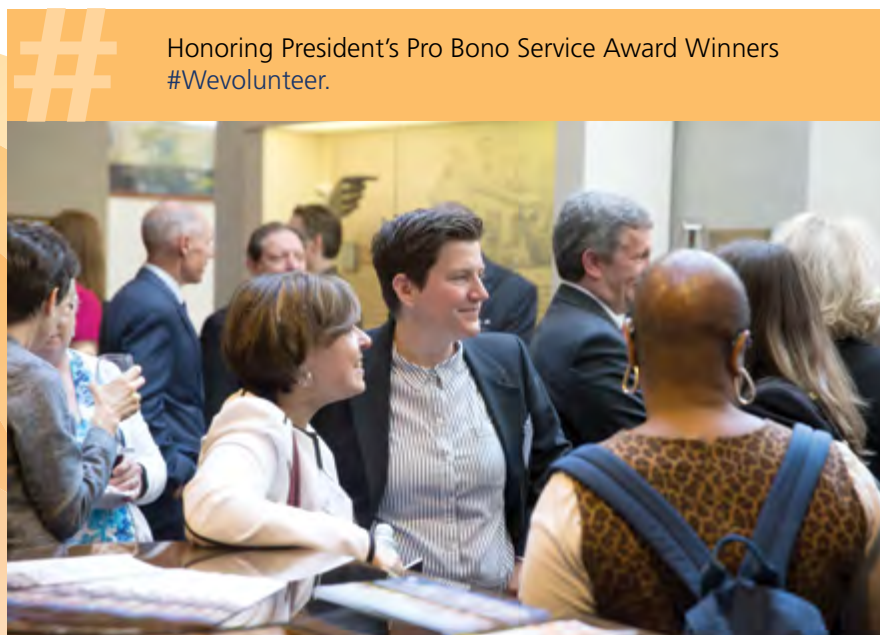
Honoring President's Pro Bono Service Award Winners #Wevolunteer.

LAP helpline: 800.255.0569 / lap@nysba.org