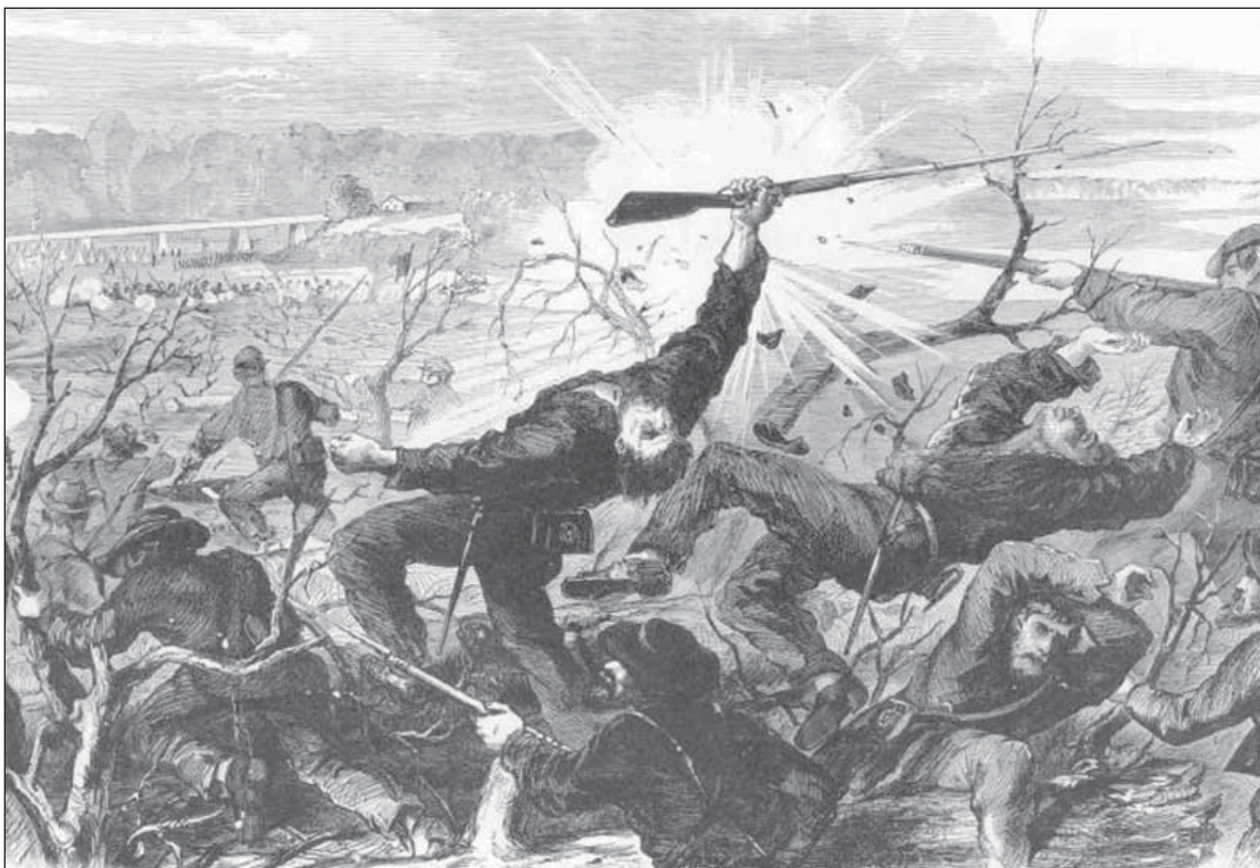
Battle of Munfordville, Kentucky, Sunday, Sept. 14th, 1862, c1863, by Harper's History of the Great Rebellion, Harper's Weekly