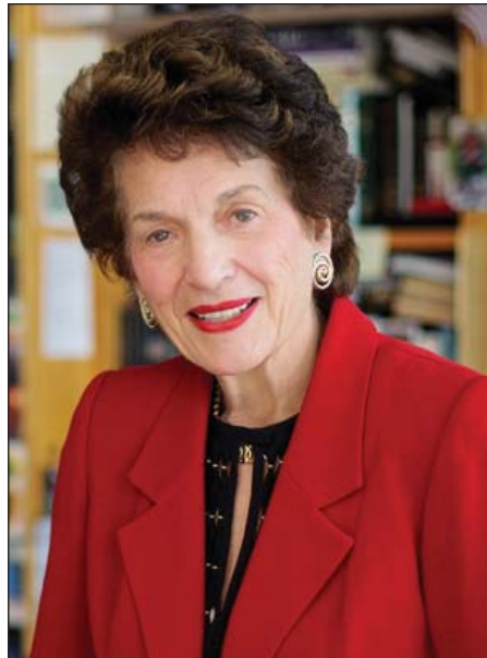
Judge Judith S. Kaye

In addition to her many other achievements, Judge Kaye was instrumental in the creation of the New York International Arbitration Center. She did not just lend her name or endorsement but rolled up her sleeves and did the hard work that was needed to create this important institution. Many agree that NYIAC would not have been established without her vision and leadership. NYIAC